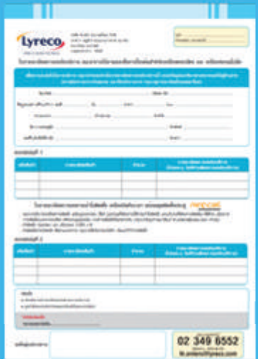
Time Recorder and Finger Print Service request form