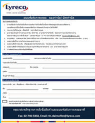
Claim offer form